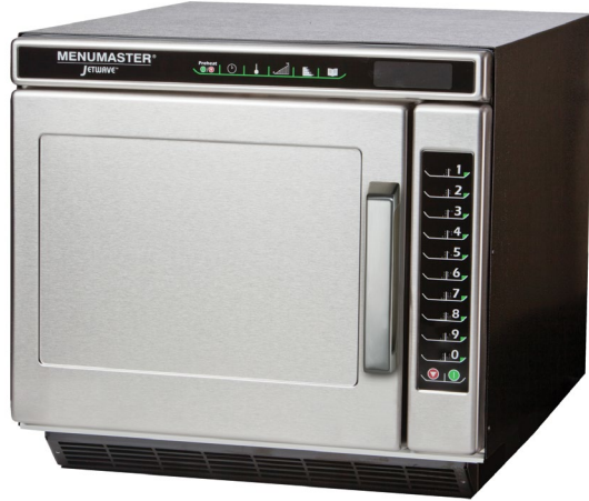
Model JET514 shown